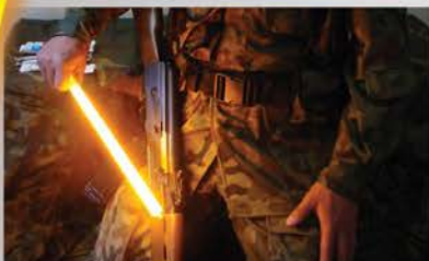
2 End Rings Impact