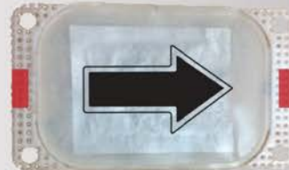
Custom Printing Available