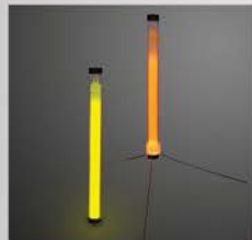
1 End Ring Non-Impact